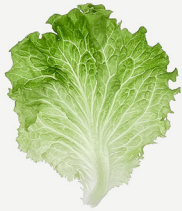
Summer Crisp #salad #juicy