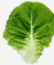
Buttercrunch #crunchy #oohlala