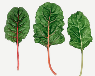
Swiss Chard #rainbow #colourful