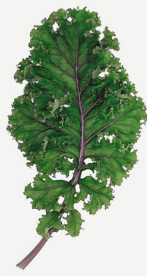
Redbor Kale #tea #citrus