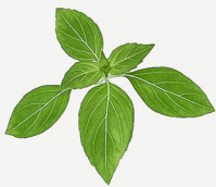
Lemon Basil #tea #citrus