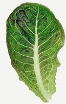
Truchas #rainbow #colourful