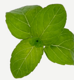
Mint #tea #drink