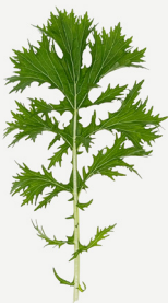
Mizuna #japanese #salad