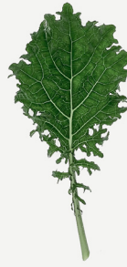
Red Russian #just #another #kale