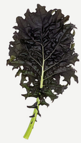
KX-1 Kale #purple