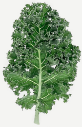
Starbor Kale #superfood