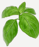
Basil #pesto #pasta